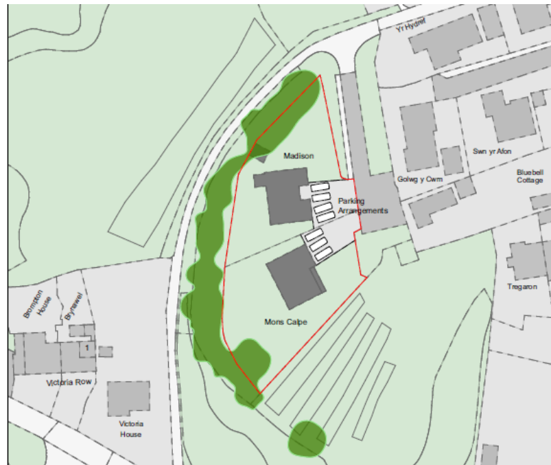
Figure 1.1 Proposed Site Plan