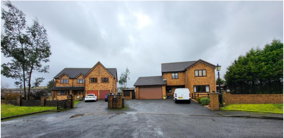
Figure 1.2 Existing and Proposed Front Elevations